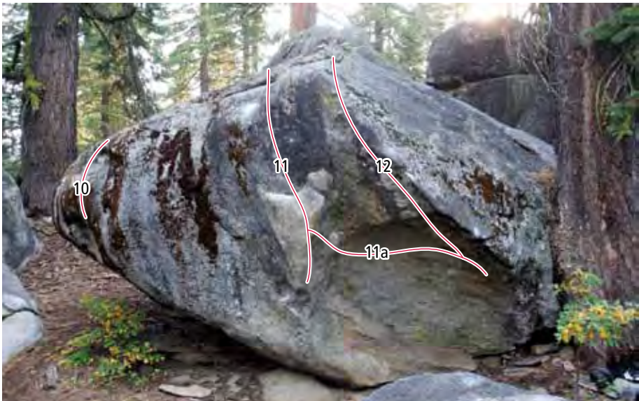
The Roadside Classic: Hueco Mantel (V0)