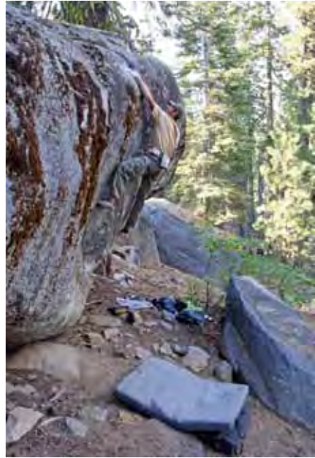
Marcos Nunez flashes Tamarack Dyno (V2).

3.8 miles east of Crane Flat and about 54.5 miles west of Lee Vining/CA395 on Tioga Pass Rd./CA-120 turn onto Tamarack Flat Rd. and drive downhill toward the campground for 0.2 miles and park on the left next to the main boulders or on