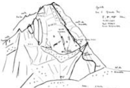
Figure 1 Cross-section of a mountain range showing geological structure and rock types.

1. Granite 2. Gneiss 3. Schist 4. Slate 5. Limestone 6. Sandstone 7. Alluvium 8. Clay